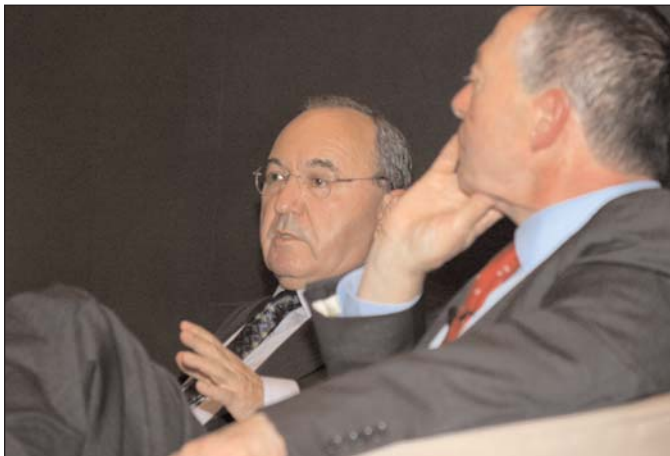
Richard Goldstone and Aryeh Neier discuss the merits and appropriateness of truth commissions.

RICHARD GOLDSTONE: Let me first say that in a perfect society, criminals should face justice and should be punished. That is the right of victims to perfect justice: proper investigations, fair procedures, and appropriate punishment of those found guilty. But when you are dealing with societies that have come through oppression, societies that have been the subject of genocide and huge crimes against humanity, it's just not possible. There are too many criminals, and there are too many victims, and there aren't enough courts to deal with them. Take