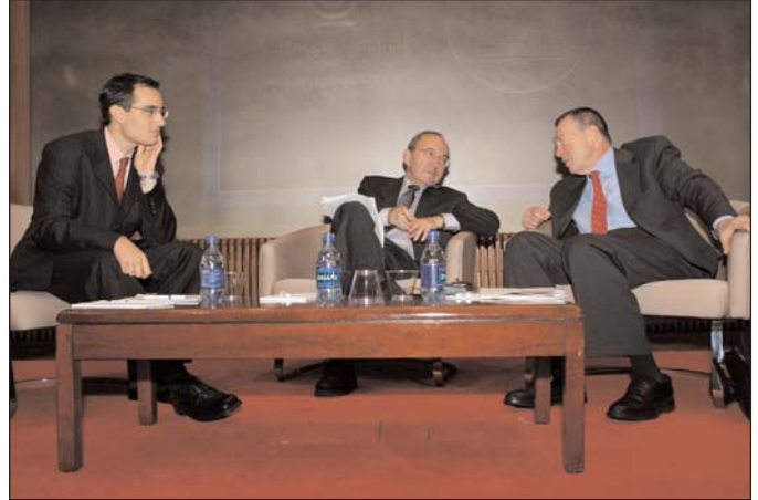
The panelists confer.

I would also say that in a country like Rwanda, where the ultimate crime of genocide was perpetrated, a truth commission seems a rather puny response. There have been cases where truth commissions exist side by side with trials. In Sierra Leone, there is a joint United Nations–Sierra Leonean criminal court that is prosecuting the leaders responsible for the horrendous crimes that