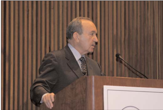
Richard Goldstone, at lectern

That culture of respect for human rights explains why our constitution is one of the most progressive in the world. The majority party, the African National Congress, was committed to a bill of rights that would act as a brake on majoritarianism. Many in the black population objected, and still object, to their duly elected representatives being constrained by a bill of rights, and to there being a court of eleven unelected men and women who can say “No, you can’t do that” even if 100 percent of the population wants to do it. But that’s what a constitutional democracy is all about. The white minority, of course, became overnight converts to a bill of rights. When they saw the writing on the wall, that there was going to be black majority rule, they grabbed the bill of rights and became great human rights protagonists. They saw in the bill of rights the protection of privileges they had acquired over 350 years.