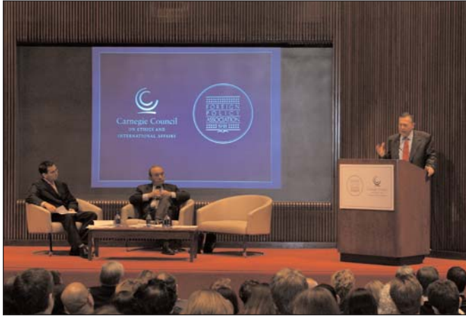
Aryeh Neier, at lectern

to follow; second, by reminding others of their commitment to abide by those agreements; third, by providing assistance to others attempting to meet those agreements; and finally, by helping to strengthen and improve those institutions that have been created to secure compliance with international