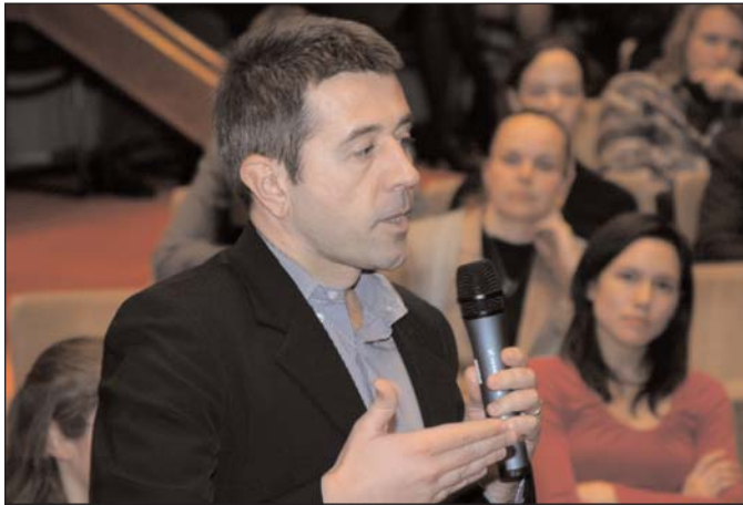
An audience member asks about the prospects for establishing a democracy compliance mechanism.

RICHARD GOLDSTONE: Since the Second World War, and at an increasing pace—I'm an optimist, not a pessimist—the world has made tremendous strides. Education is helping, and has changed things. Before the ad hoc tribunals were set up by the Security Council, there were no